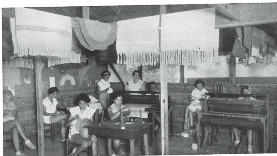
Skill in Weaving, Craft Department

Everybody likes to be able to make things to take home from camp. At Greystone the girls weave rugs on the looms, make jewelry from silver and precious stones, tool leather, bind books, weave baskets, and learn many other fascinating crafts.