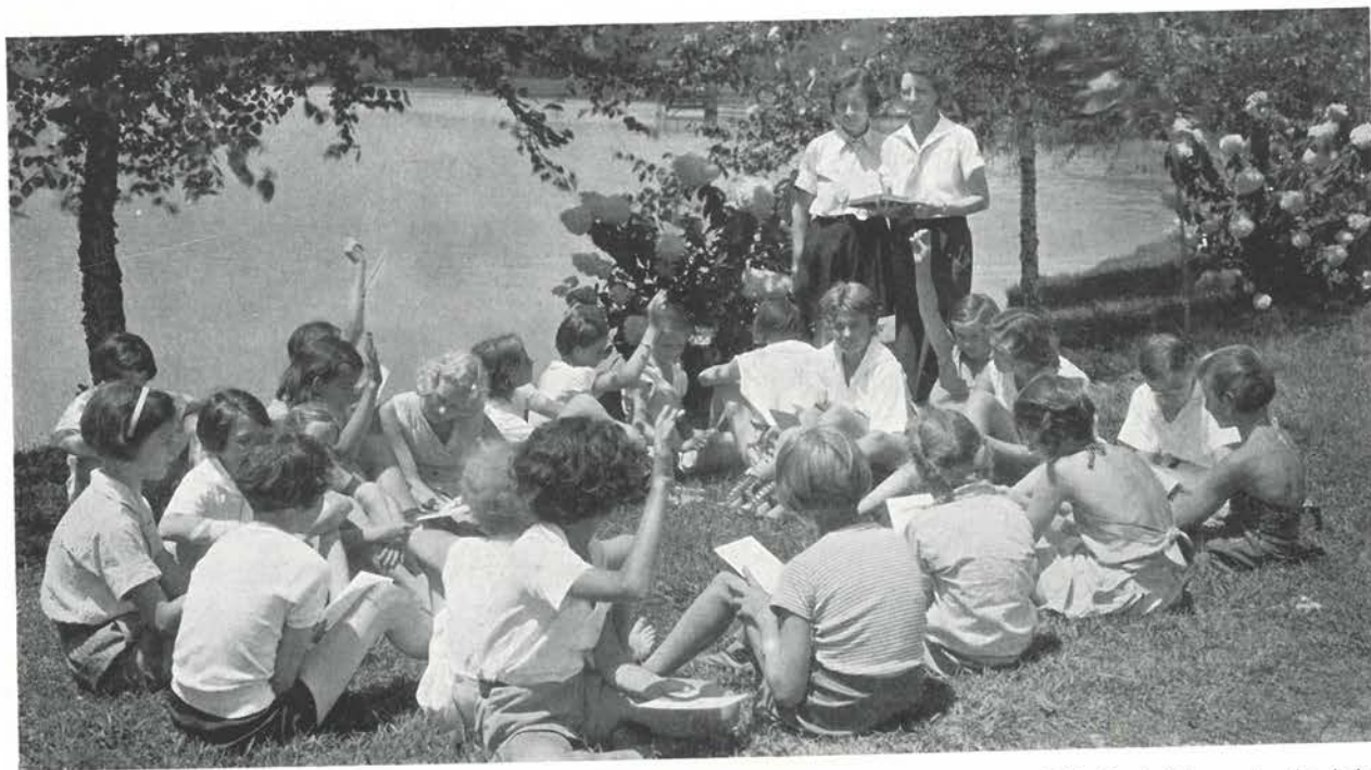
Bible Study Classes by the Lake

BIBLE STUDY is conducted by special councillors who have taken comprehensive courses in Bible teaching. Camp Greystone believes in the Bible as the foundation of character and offers several most attractive courses. These courses are optional.