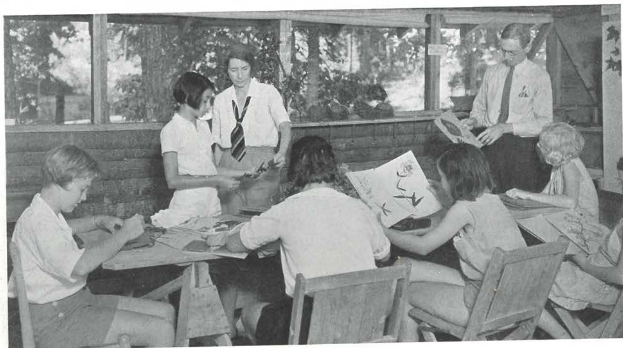
Nature Classes are thrilling