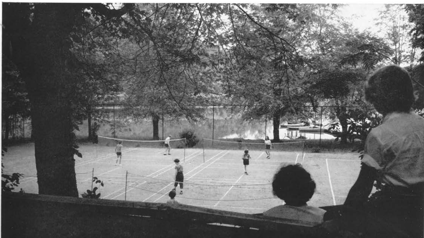
● The badminton courts by the lake are always a popular spot.

The Counselor Staff is a splendid group of fine Christian young women chosen for their high ideals, competence in their chosen sport and attractive personalities. Greystone is fortunate to have on the counselor staff many of her former campers, who have grown up in the fine environment of Greystone and who pass on the "Greystone Spirit" to each new camper.