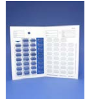
Dinner Blister Pack

* All 3 medications go in one blister/bubble together for each day of camp (ex: 21 blisters filled with all 3 medicines for June morning meds)