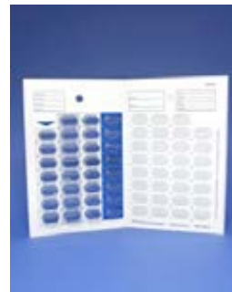
Morning Blister Pack