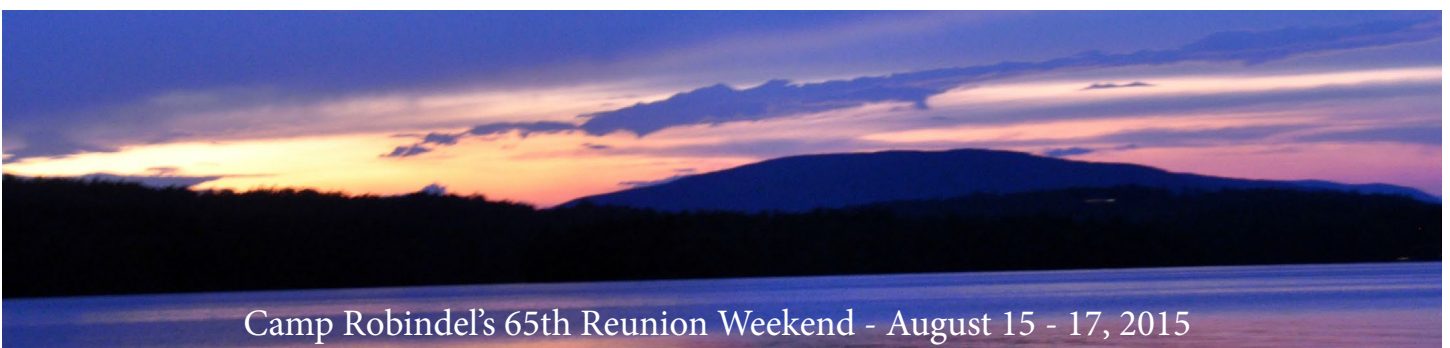
Camp Robindel's 65th Reunion Weekend - August 15 - 17, 2015