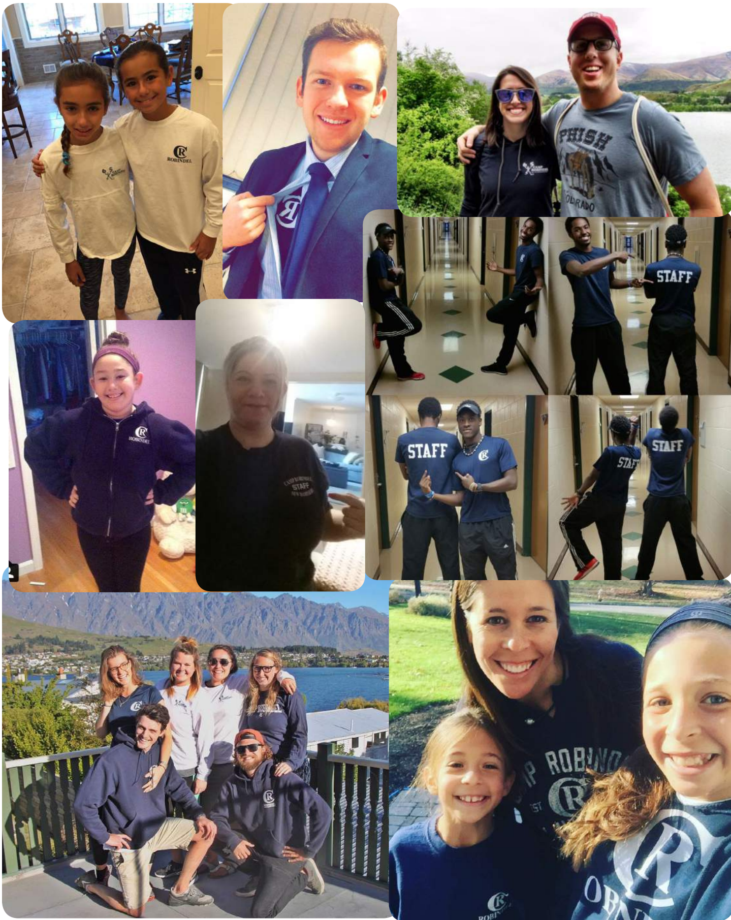
These 6 CR counselors are spending the year together in New Zealand! We love seeing friends from CR become life-long friends around the world!