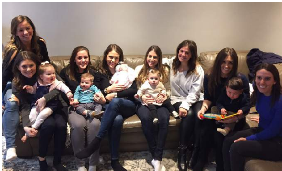
Juniper 2001 friends in NYC.